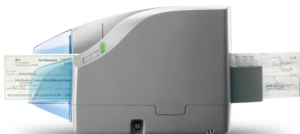
Image Compression Standards

JPEG (24-bit color, 8-bit grayscale) BMP (24-bit color, 4 or 8-bit grayscale) TIFF Group 4 B/W