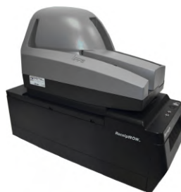
Stackable Receipt Printer Option

153000-51 TS240-75 (TS240 75 DPM standard model) 153000-52 TS240-75-IJ (TS240 75 DPM with inkjet endorser) 153000-62 TS240-100-IJ (TS240 100 DPM with inkjet endorser) 153000-71 TS240-50 (TS240 50 DPM standard model) 153000-72 TS240-50-IJ (TS240 50 DPM with inkjet endorser) 153001-72 TS240-50 IJ-F (TS240 50 DPM with inkjet endorser & franker) 153005-52 TS240-75-IJ-UV (TS240 50 DPM with inkjet endorser & UV) 153005-62 TS240-100-IJ-UV (TS240 100 DPM with inkjet endorser & UV) 153005-72 TS240-50-IJ-UV (TS240 50 DPM with inkjet endorser & UV)